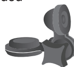
HM-8 Standard Rotatable Connector