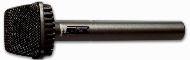
Figure of Exterior Dimensions